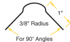
Drawing not to scale

All Phillips products are made in the U.S.A.